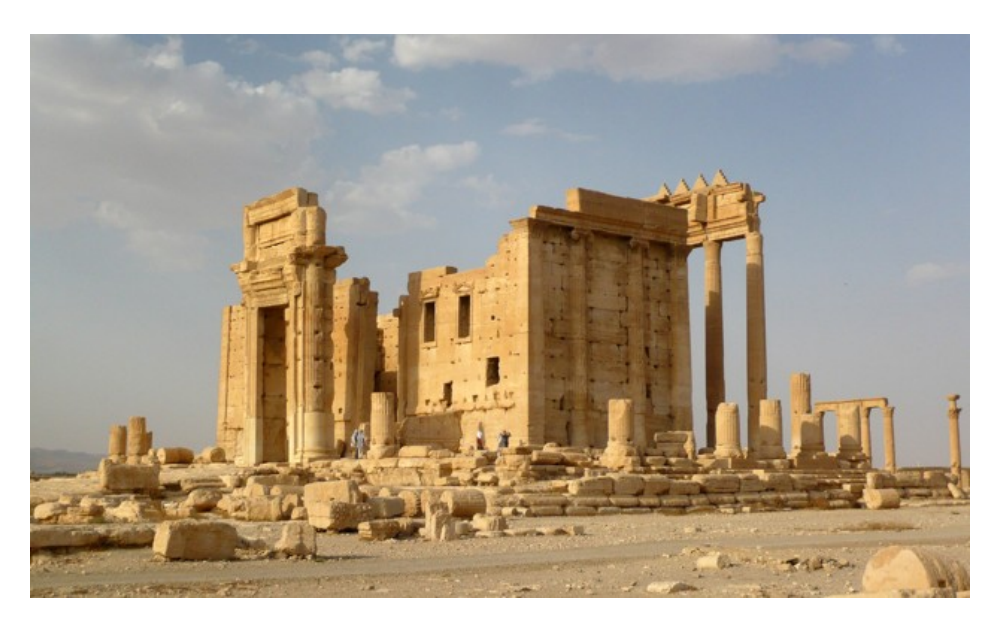
The Temple of Bel in 2010, before its destruction at the hands of ISIS

is not an eighth-century caliphate, it is a 21st-century caliphate—more evidence against the inclination to regard the 21st century as a millennium.