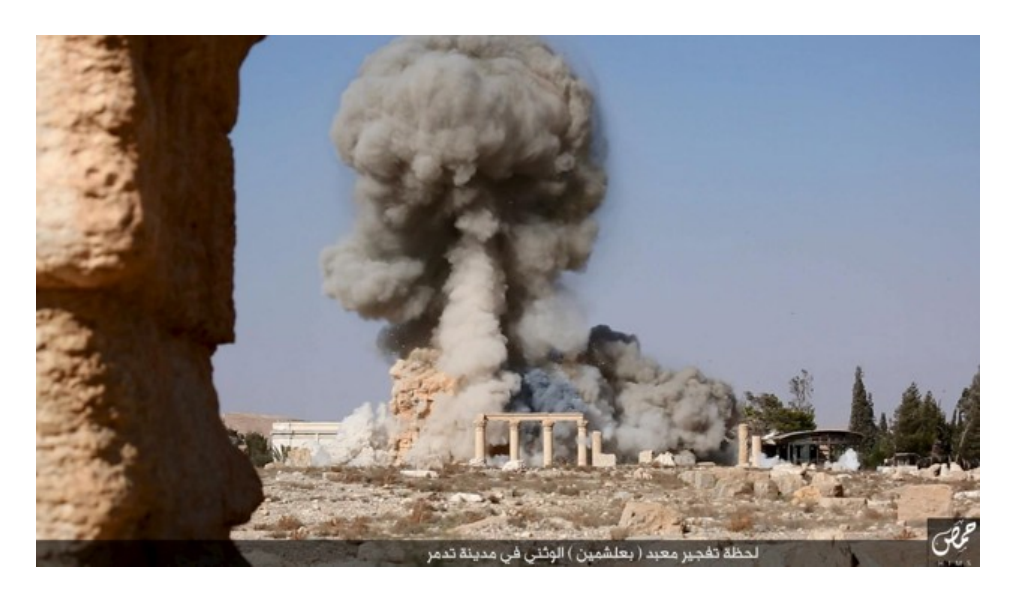
An image distributed by ISIS on social media with the caption, "The moment of the explosion of the Baal Shamin pagan temple in the city of Tadmur."

America is no longer moved by the moral imperative of support and rescue, even when, as in Syria, it is plainly in its strategic interest. (I know, we rescued the Yazidis.) The 71 immigrants who were found dead in a truck on a Hungarian road, the corpse of a little boy that washed up on a Turkish beach, the hundreds of thousands of desperate people (out of 4 million) now making their way to Europe—these friendless people were killed or exiled in part by the Western refusal to face the horrors of Syria four years ago. All this was predicted. What did we think would happen if we did nothing?